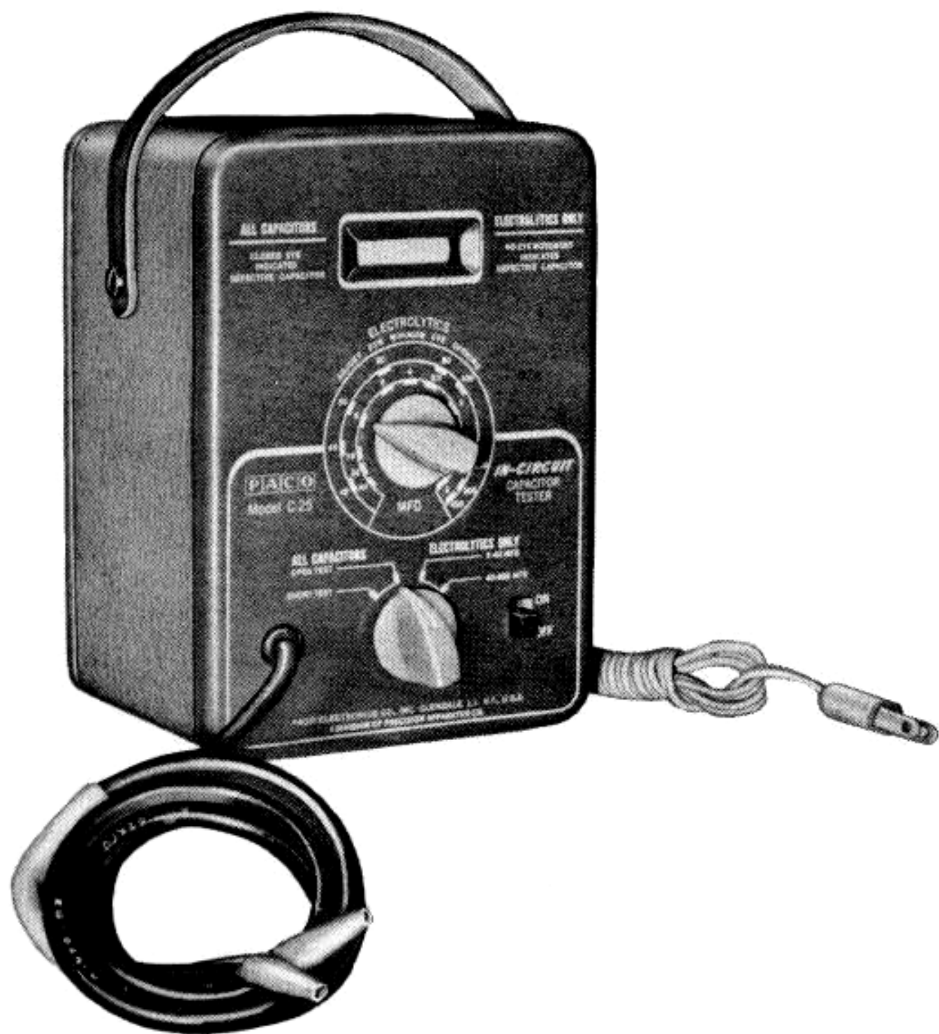
Figure 1. PACO Model C-25 "In-Circuit Capacitor Tester