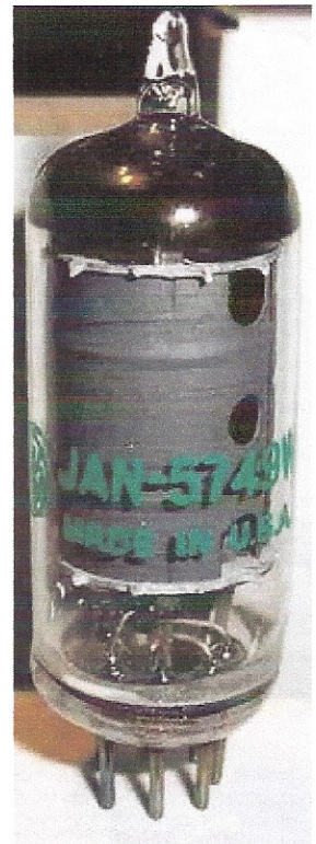
sedmann bert Karlheinz Fischer

Base Miniatur-7-Pin-Base B7G, USA 1940 Was used by Military and/or Government Filament Vf 6.3 Volts / If: 0.3 Ampere / -: Indirect /