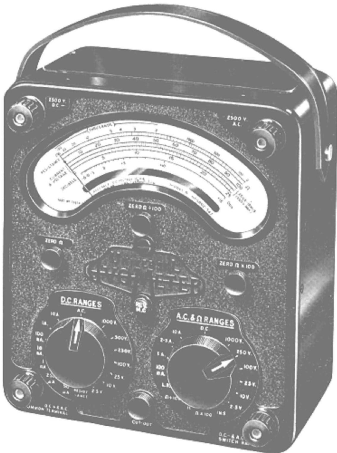
THE MODEL 8 AVOMETER MK. II