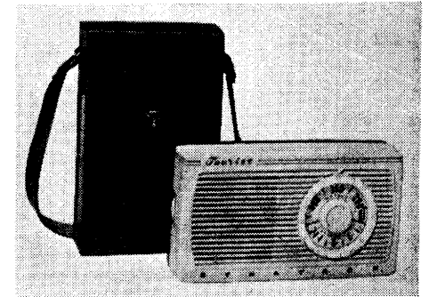
The Tourist TP14 is shown here with its leather carrying case, available as an extra

VT1 is a self-oscillating mixer with collector emitter feedback via tuned winding L5. Two IF stages VT2 and VT3 feed detector MRI which provides AGC via R6. Driver transistor VT4 feeds signal to output stages via transformer T1. Output transistors VT5 and VT6 feed up to 250mW to 3ohm speaker via T2. Neutralizing of IF stages is achieved by C16, 22 and R5, 10.