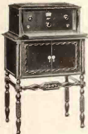
APEX MODEL No. 106 Without Accessories—$175