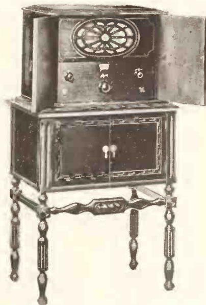
APEX MODEL No. 116 Without Accessories—$210