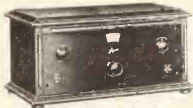
APEX MODEL No. 5 Without Accessories $85