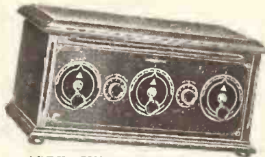
APEX SUPER 5 Without Accessories—$80